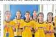
प्रतियोगिता में आरके इंटरनेशनल स्कूल की छात्राओं ने खूबियाँ राखीयाँ