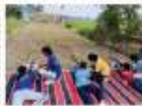
भार के इंटरनेशनल स्कूल में 42 बिहार बटालियन का फायरिंग प्रशिक्षण आयोजित किया गया।