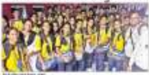
आरके इंटरनेशनल स्कूल का सीबीएसड मल्टीस्टर बिहार-आरकेड कबड्डी में दबदबा