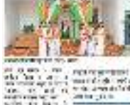
आरके इंटरनेशनल स्कूल में सांस्कृतिक कार्यक्रम आयोजित किया गया।