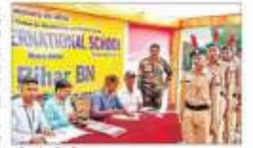
42 बिहार बटालियन एनसीसी की 10 दिवसीय ट्रेनिंग प्रारंभ